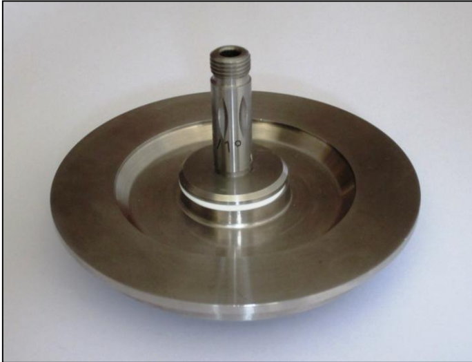
Fig. 2: Cone-plate measuring system, cone angle 1^\circ