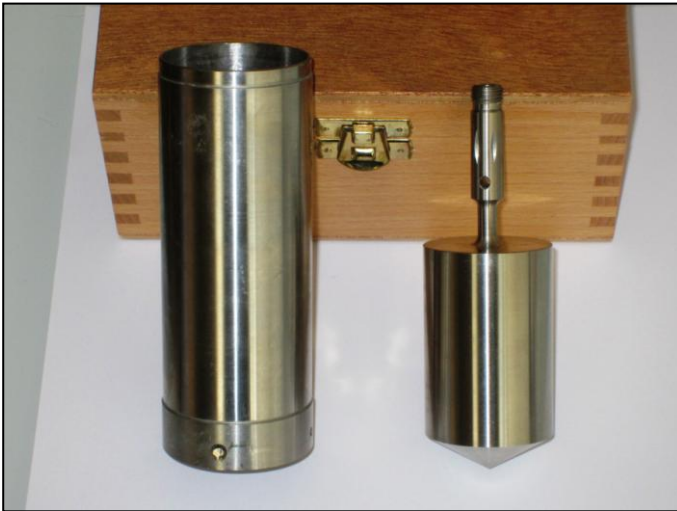
Fig. 1: Coaxial cylinder measuring system, left outer cylinder, right inner cylinder

In the case of rate-controlled rotational rheometers (CR) the material is subjected to shear in a gap and the resulting shear stress is measured. This is done e. g. by using coaxial measuring systems by rotation of the outer cylinder of a Couette system (or inner cylinder of a Searle system). The shear rate for any rotational speed can be calculated from a knowledge of the test equipment geometry. Fig. 1 shows a coaxial cylinder measuring system consisting of outer (left) and inner cylinder (right). In a so-called cone-plate measuring system (fig. 2), the shearing occurs in the gap that is formed between a plate and the cone.