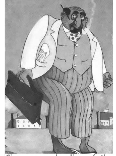
Cigar, saggy bending of the knees, protrusive eyes: this is not Bleistein, but the similarity suggests that the imagery was part of the public discourse.