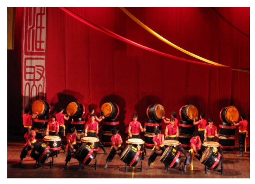
Figure 6: A drum troupe from Foon Yew High School in 'Huiju' [汇聚], a thematic concert held in Foon Yew High School on 8 December 2006.