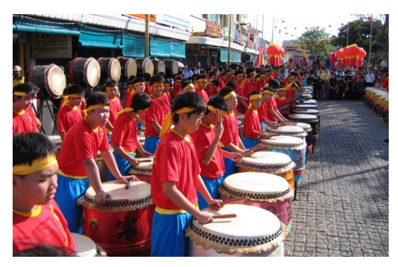
Figure 9: Young drummers from Chung Ling Private High School and SJK (C) Wen Khai (opposite rows) stood by for the opening show in Penang Miaohui on 24 February 2007.