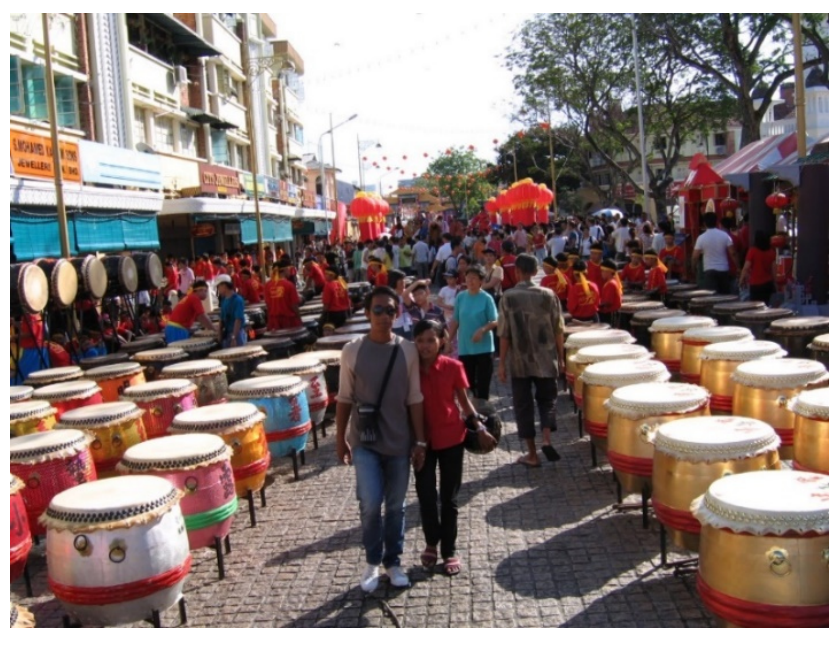
Figure 8: Penang Miaohui [槟城庙会] or the official Chinese New Year celebration is one of the major functions in Malaysia with a constant showcase of 24 Jieling Drums. This scene depicts the setup for guest arrivals in Jalan Masjid Kapitan Keling, George Town, Penang, on 24 February 2007.