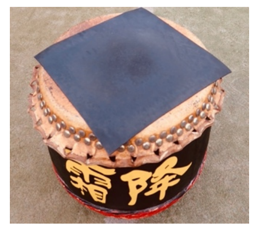
Figure 4: 24 Jieling Drums with a sound adsorbing mat.

To young people, one of the most attractive features of 24 Jieling Drums is its flexibility. There is no fixed form in the performance, and drummers are free to create their compositions by incorporating foreign musical elements based on their interpretation.