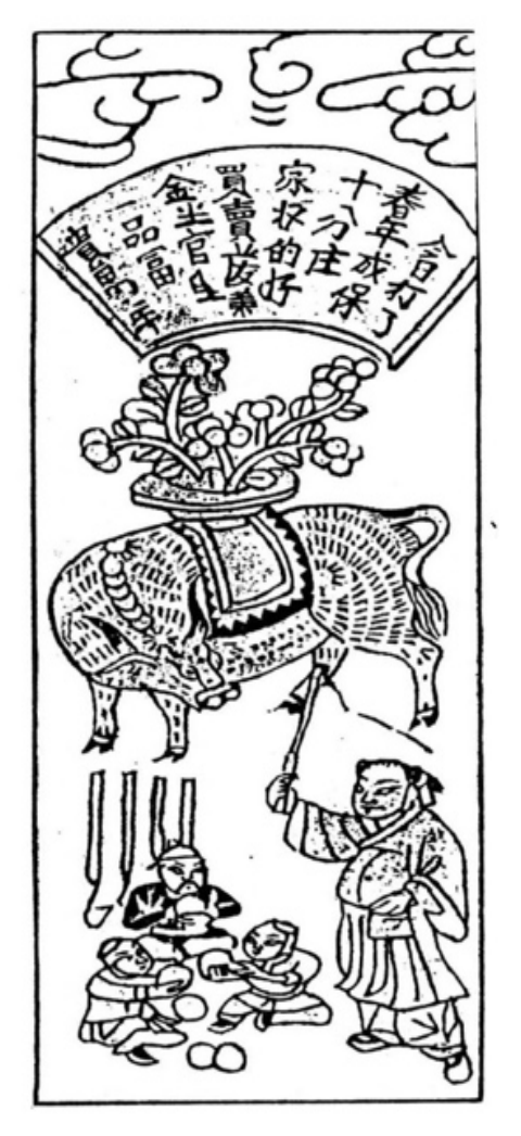
Figure 2: Spring ox beating (Han & Wang, 1998: 42).

Apart from the above example, there are many other customary activities related to agronomical timing, such as the Tomb Sweeping Day during qingming . Since the social system in ancient China was based on the farming system, agricultural practices were ingrained in many Chinese customs. However, the use of modern technology has vastly changed modern agricultural practices. As most people do not need to farm in their daily lives, it became harder to associate customs with 24 solar terms (Zhang & Tian, 2017: 1170). Nevertheless, the solar terms are still an integral part of modern Chinese culture through written and oral transmission and continue to influence the lifestyle of modern Chinese. Despite the decline of agricultural civilisation, folk cultures and 24 solar terms are still well-preserved and ingrained in people's awareness of health and wellness nowadays (Shang & Zhou, 2015). In the book entitled 'The Regimen of Huangdi Neijing and Twenty-four Solar Terms' [黄帝内经二十四节气养生法], a sum of knowledge about healthcare is introduced with connections with the solar terms.