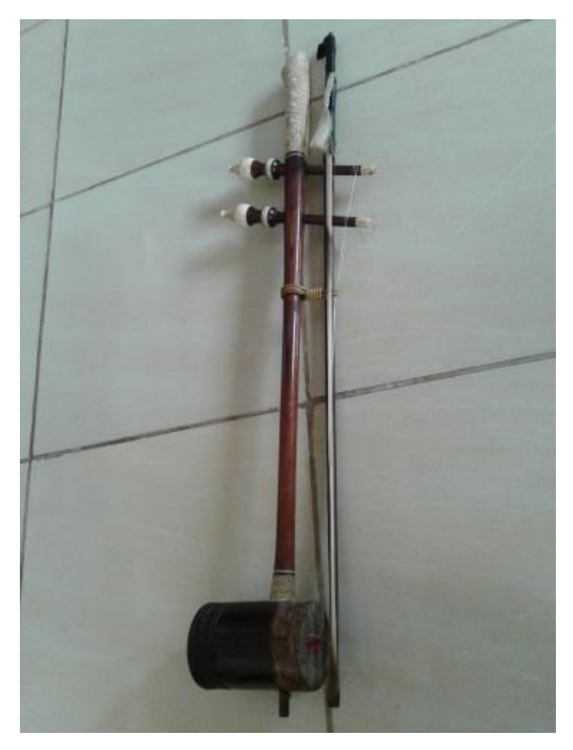
FIGURE 2: Khmer people's Truô sô (photo by the author).

The wind instruments resembling those of the Khmer khlôy are, the tàlía of the Co, Sedang, or H're, the alal of the Bahnar, the kađeh of the Raglai, the đinh k'lía of the E-de, the ống ôi of the Muong, the píthiu of the Thai, the pi flute of the H'mong, the tieu of the Vietnamese, and the xiao of the Han.