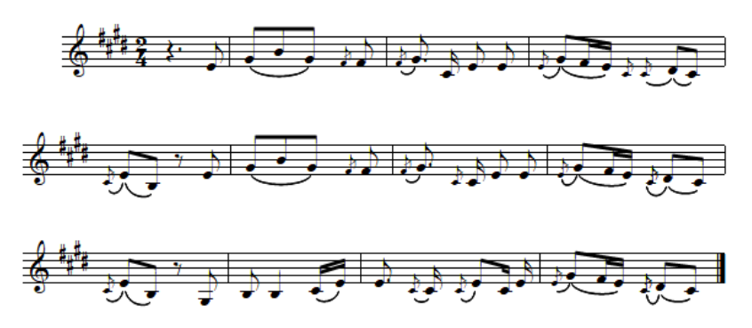
FIGURE 17: Excerpt of the song titled Xrây Rot [Ms. Rot].

Type 2 in the 6-tone scale is composed of two groups of 3 sounds. It s recommended to consult the Xôridang (Sun), which was collected in the Ha Tien of Kien Giang province. It has the same scale structure as well presented in the following example: