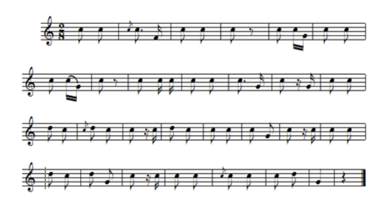
FIGURE 8: Excerpt of the song titled Chap koonkhleng [Catch a kite].