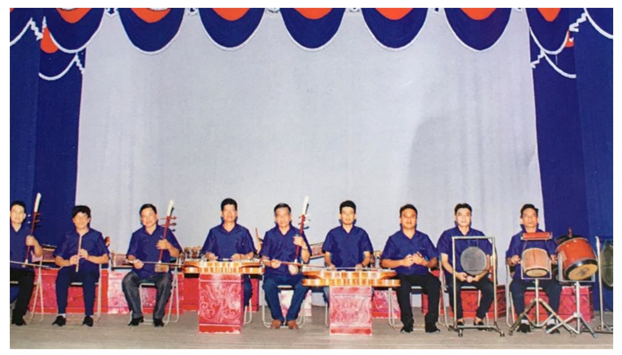
FIGURE 1: Khmer Southern Orchestra (photos by courtesy of the Khmer Ánh Bình Minh Art Delegation).

materials and ascribing them to specific talents. Relevant data had to be compiled to contribute to the clarification of the research issues posed for the characteristics of Khmer folk music in the South of Vietnam.