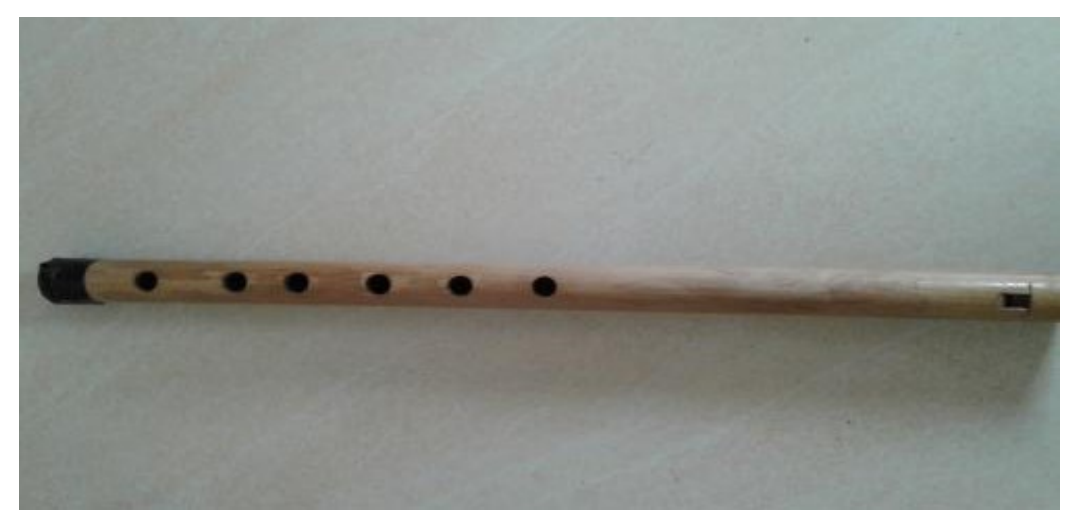
FIGURE 3: Khmer people's Khlôy.

The wind instruments resembling those of the Khmer khlôy are, the tàlía of the Co, Sedang, or H're, the alal of the Bahnar, the kađeh of the Raglai, the đinh k'lía of the E-de, the ống ôi of the Muong, the píthiu of the Thai, the pi flute of the H'mong, the tieu of the Vietnamese, and the xiao of the Han.