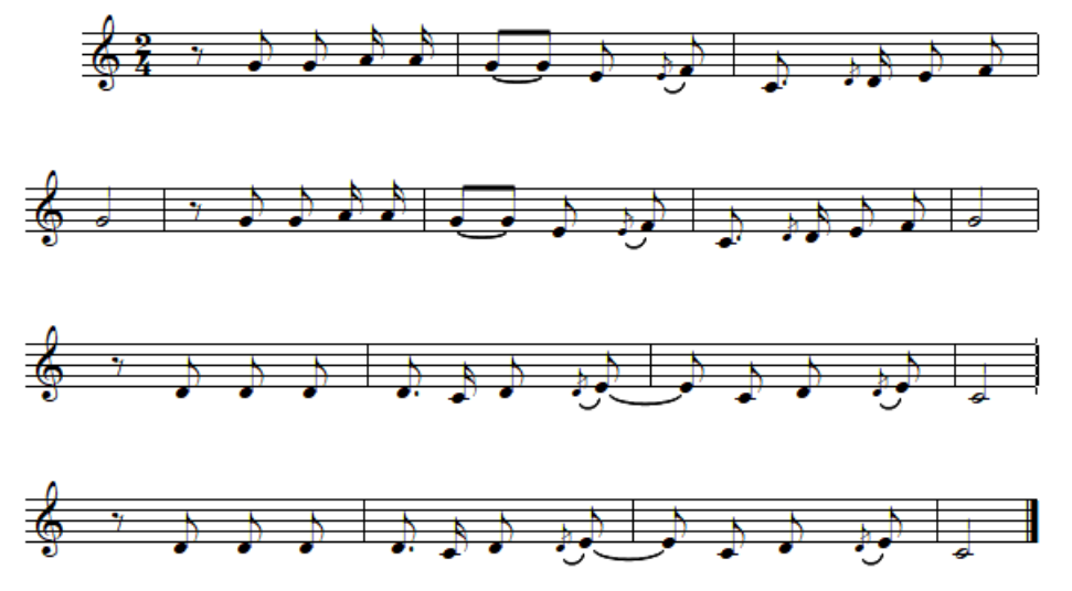
FIGURE 16: Excerpt of the song Bompê Kôn 1 [lullaby 1].

The song Xrây Rot (Ms. Rot) reveals a similar scale structure: