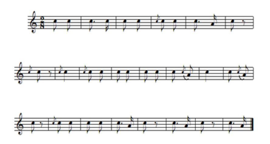
FIGURE 5: Excerpt of Khmênh khuyal krobây [playing in the field].

Type 3 in Playing outside in the field collected in Tra Vinh province, there is a major third interval (bes1 - d2):