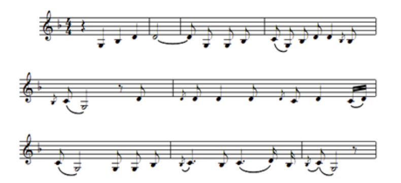
FIGURE 10: Excerpt of the song titled Oum tuck [Paddlers in boats].

Or the song Oum tuck (paddle boats) collected in Loc Ninh district, Binh Phuoc province, has the same scale structure.