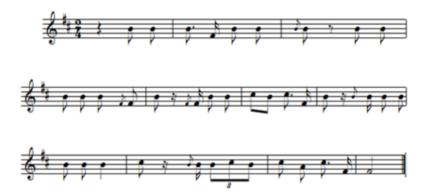
FIGURE 7: Excerpt of the song titled Chăcturcđôông [Pour coconut water].

A 3-tone scale is used in Khmer children's songs found in the song Chăc turcđôông (Pour coconut water) and Chap koonkhleng (Catch a kite) in the Kien Giang province. The following examples present a series of three fixed tones (fis1 - b1 - cis2):