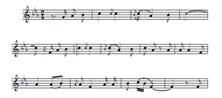
FIGURE 9: Excerpt of the song titled Mê Trây [Guests leaving].

The 4-tone scale in the Khmer tunes also has many types. The following belongs to the common types. In the song M\hat{e} Tr\hat{a}y (Guest leaving) collected in Go Quao district, Kien Giang province, the tone order f1 - aes1 - bes1 - c2 was formed.