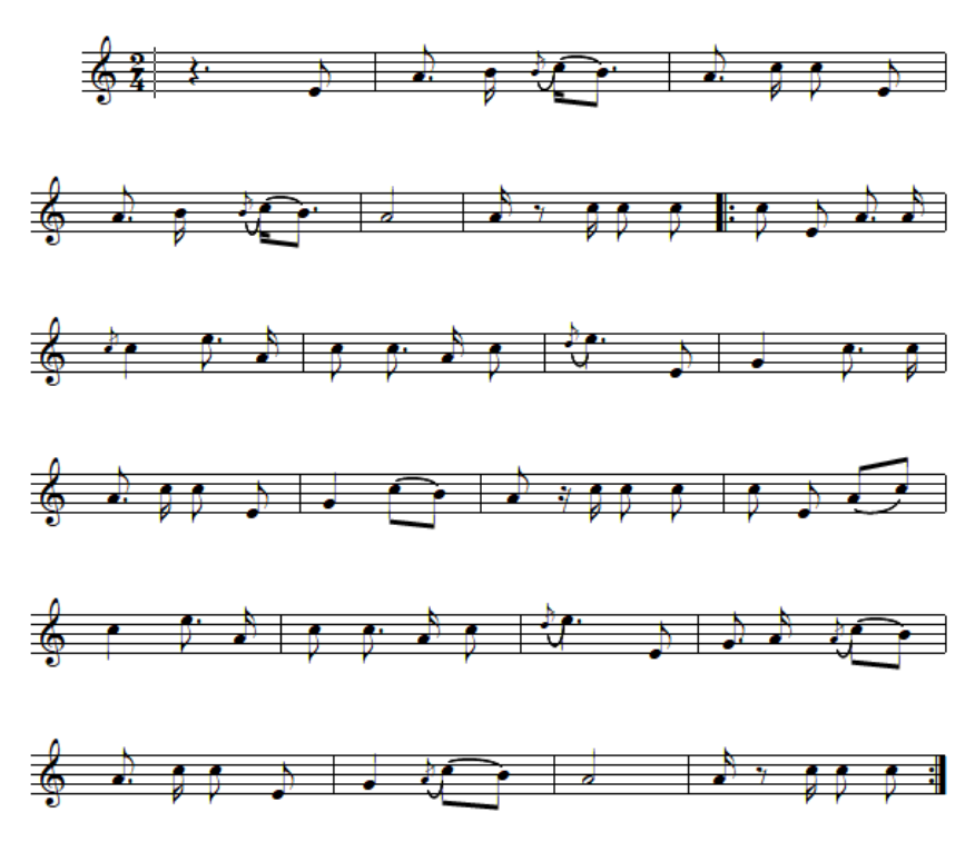
FIGURE 15: Excerpt of the song Kom Boontôh Boong [Don't blame me].