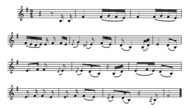
FIGURE 14: Excerpt of the song Xarikeo [Starling].

Also, the song named Kom Boontôh Boong [Don't blame me] possesses the same scale structure given as follows: